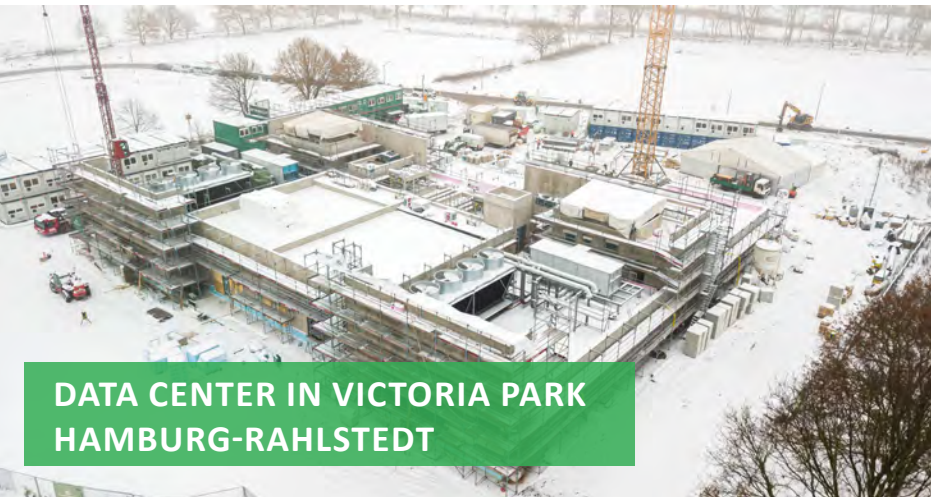
DATA CENTER IN VICTORIA PARK HAMBURG-RAHLSTEDT